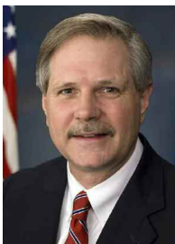
Sen. John Hoeven